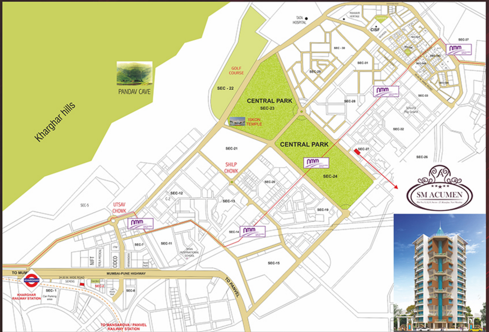
KHARGHAR RAILWAY STN.